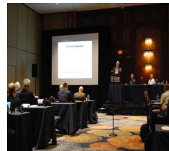
Task Force on Switching Transients induced by Transformers / Breaker Interaction PC57.142