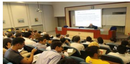
First IEEE PES Student Congress Ankara, Turkey